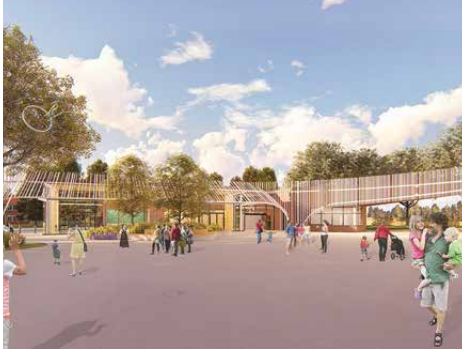
FRONT ENTRANCE AND GUEST SERVICES PLAZA

We are also pleased to offer naming opportunities in the other exciting features of the Fort Edmonton Park expansion