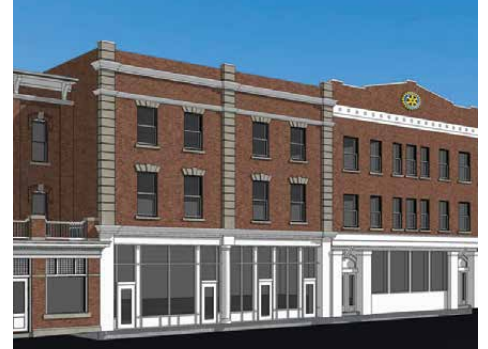
HOTEL SELKIRK: WINDSOR AND ALBION BLOCKS