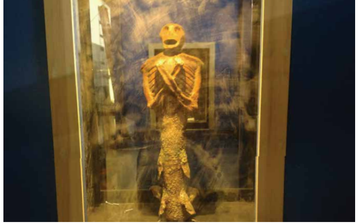
Feejee Mermaid $10,000