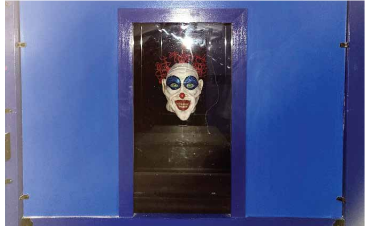
Clown Head $10,000