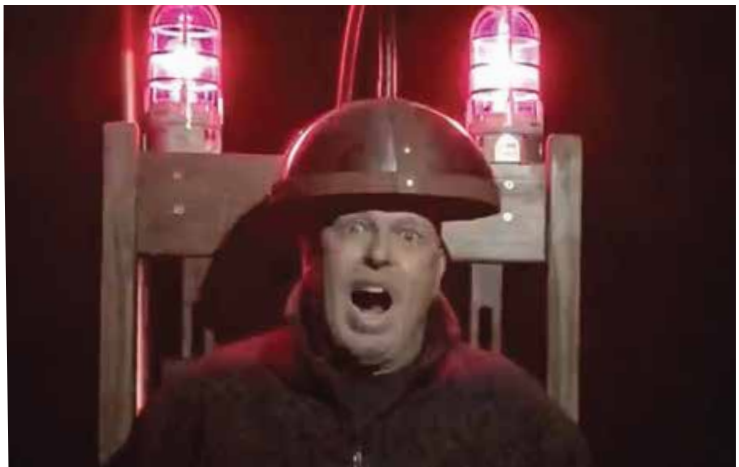
Electric Chair $10,000