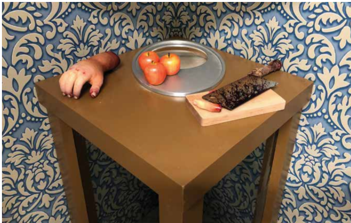
Decapitation Table $10,000