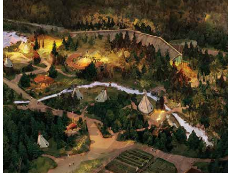
INDIGENOUS PEOPLES EXPERIENCE