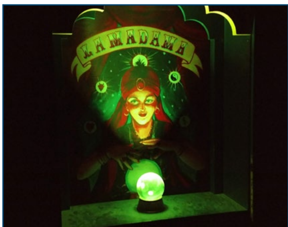
Fortune Teller $10,000