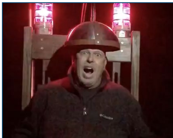
Electric Chair $10,000