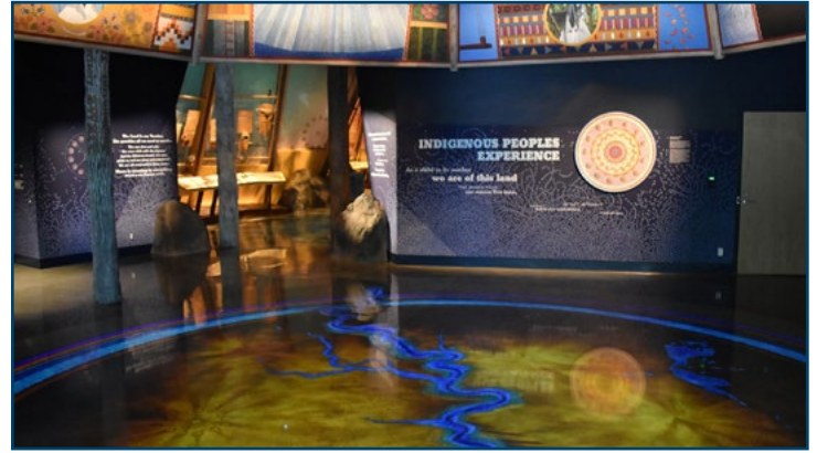
Indigenous Peoples Experience

In addition to the naming opportunities in the Johnny J. Jones Midway, the Fort Edmonton Foundation is pleased to offer naming opportunities at Fort Edmonton Park including the Front Entry Plaza and Guest Services Area, and the Indigenous Peoples Experience. If you are interested, we can provide you with a list of opportunities that are currently available.