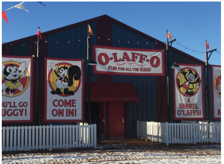
Fun House $150,000

The Cabinet of Curios exhibit features reproductions of some of the world's greatest oddities known to early 20th century man. A trip through this customized side show reveals screams, tricks and other cool effects.