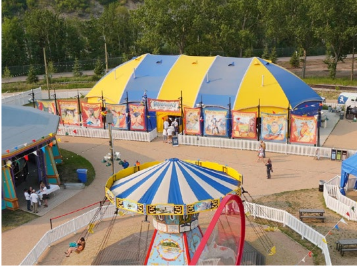
Event Tent $250,000

Built as a home for both private and public events, the event tent features 3,800 square feet of open space for every type of event imaginable. Ventilated for the warmer months and heated for cooler days, this three-season, fully serviced food and beverage space is built for versatility.