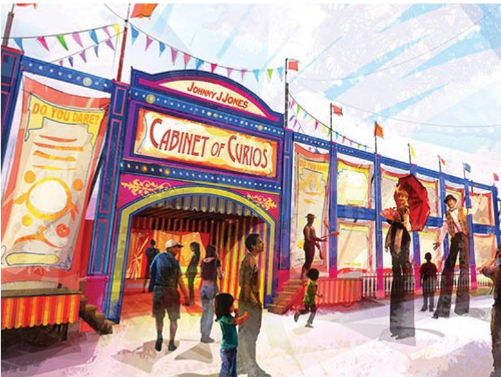
Cabinet of Curios $250,000

The Cabinet of Curios exhibit features reproductions of some of the world's greatest oddities known to early 20th century man. A trip through this customized side show reveals screams, tricks and other cool effects.