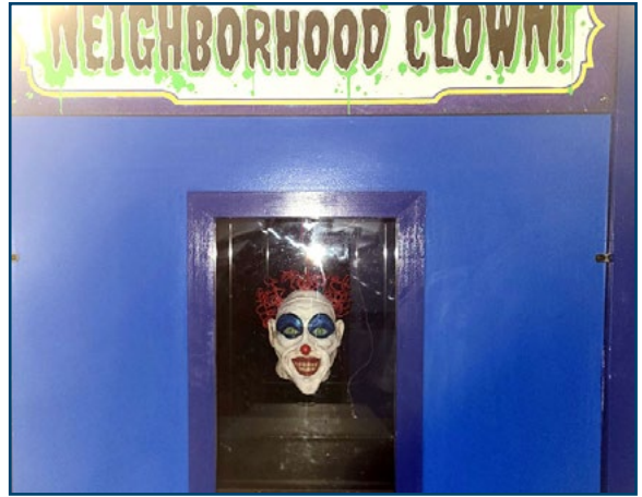
Clown Head $10,000