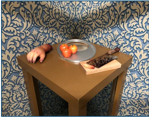
Decapitation Table $10,000