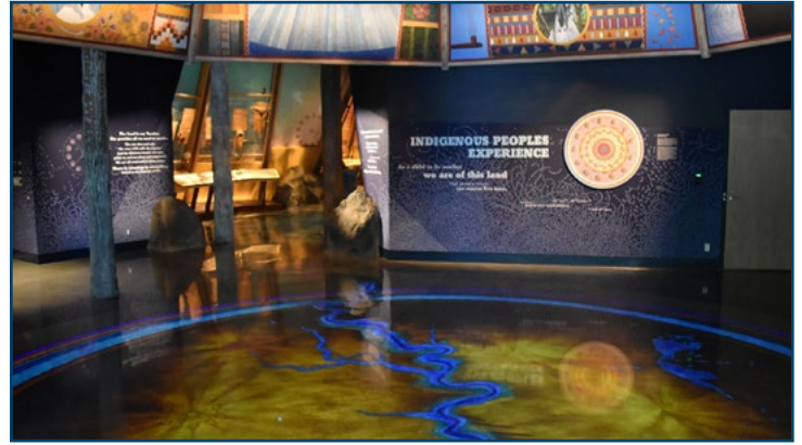
Indigenous Peoples Experience

In addition to the naming opportunities in the Johnny J. Jones Midway, the Fort Edmonton Foundation is pleased to offer naming opportunities at Fort Edmonton Park including the Front Entry Plaza and Guest Services Area, and the Indigenous Peoples Experience. If you are interested, we can provide you with a list of opportunities that are currently available.