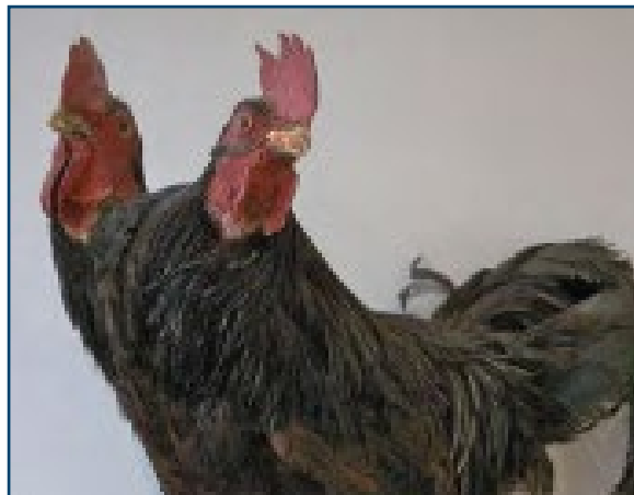
Two Headed Chicken $10,000

The Cabinet of Curios contains attractions that are adaptations / recreations of typical 1920s punks and tricks from Midway shows. Some are designed to accommodate both mannequins and live performers such as Spidora and the Werewolf. Guests will proceed through the maze tricks, up the stairs and down the slide.