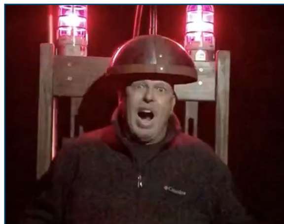
Electric Chair $10,000