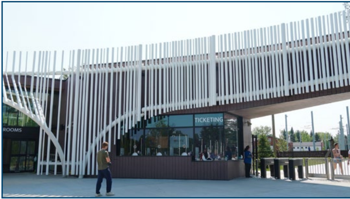
Front Entry Plaza and Guest Services