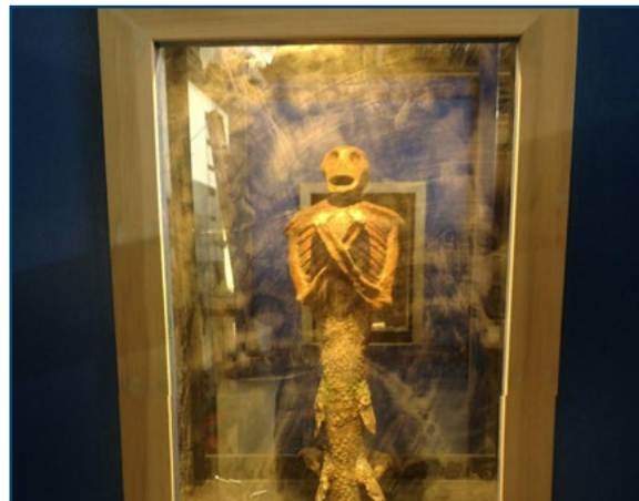
Feejee Mermaid $10,000