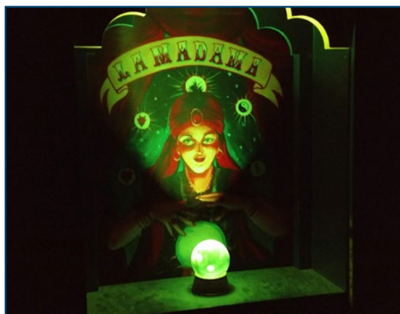
Fortune Teller $10,000